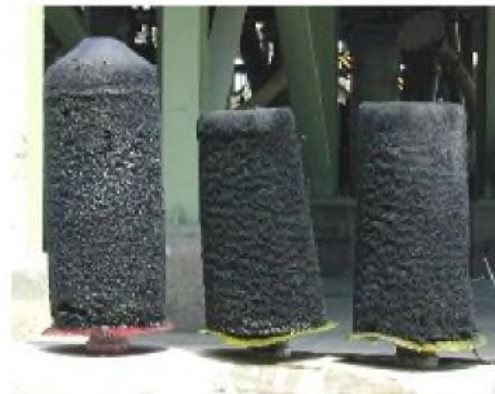
Pigs run through a scaled 8" water line. Left Two Pigs: RBS, medium hardness. Right Two Pigs: YBS, soft type