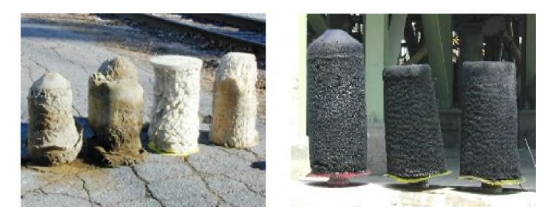
Pigs run through a scaled 8" water line.

The above photograph illustrates how the soft foam is worn away to indicate the true opening in the pipeline. The pigs on the left were the first ones run and indicate a severely restricted pipe. The pig on the right was the last pig run after cleaning and indicates a clean pipe.